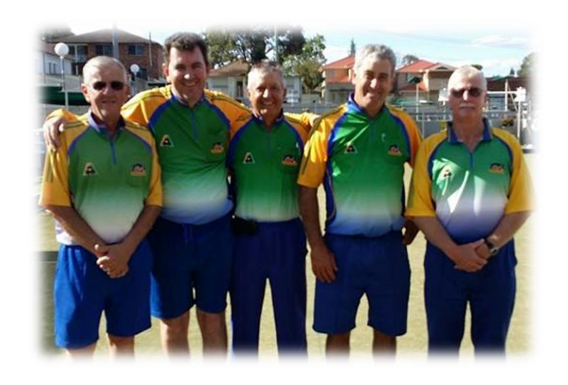
MERRYLANDS - WINNERS (A GRADE)