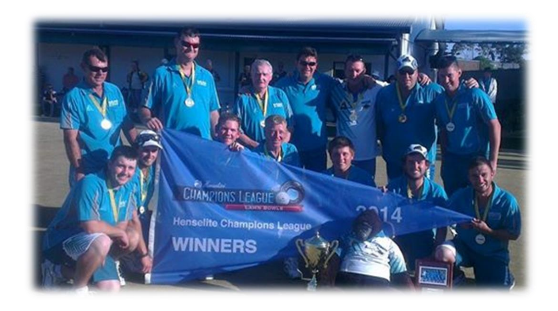
Mount Lewis Lions - 2014 Champions

The finals of the 2014 Champions League were held last weekend at Mount Lewis BC with the Grand Final between Warilla Gorillas & Mount Lewis Lions. In the end the Gorillas won the 1<sup>st</sup> set 27 to 20 & the 2<sup>nd</sup> set 37 to 27 to take out this years title. Unfortunately, the Merrylands Magic after finishing on top of the ladder after the prelininary rounds, were defeated in straight sets in the Preliminary Final by Mount Lewis Lions.