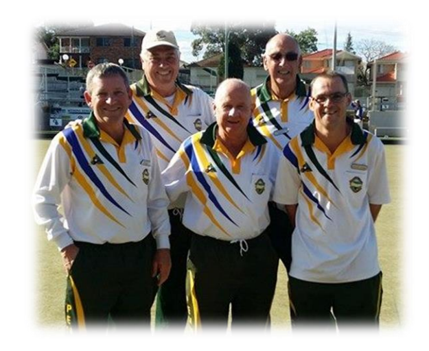
PENNANT HILLS - WINNERS